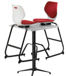
Stacked on table