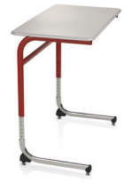
ADA W36 D20 H28-34