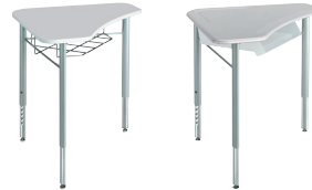
Linear W23.5 D36.5 H22-34