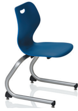
18" W20.25 D20.5 H32 Seat: W17.5 D17 H18