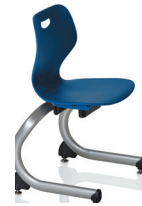
13" W15.5 D14.25 H23 Seat: W12.5 D12 H13.75