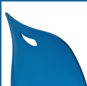
Integral handle enables easy movement