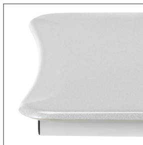
Curved desk edge provides increased belly room