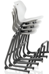
Stacked on floor

W20.25 D21.75 H38.5 Seat: W17.5 D17 H24.5