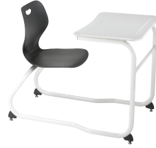
Extra Large W26 D38.25 H32 Seat: W17.5 D17 H18 Belly Room: 17.5