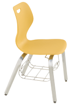
18" W19.75 D20.5 H32 Seat: W17.5 D17 H18