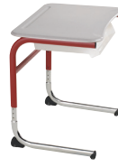
Adjustable W26 D19 H24-30