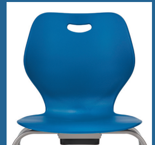
Wider back provides greater support