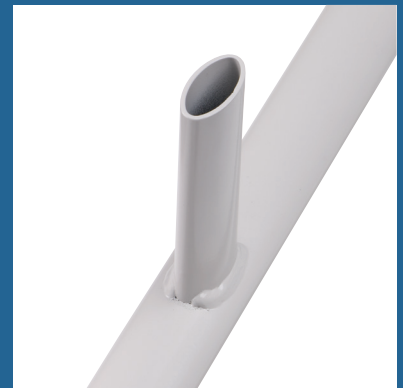
Elliptical tubing depth dimension is twice as thick as round tubing and more dent resistant. Exceeds ANSI/ BIFMA tests for back strength, back durability, seating drop, seating impact, leg strength and tablet arm load.