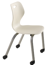
18" W19.75 D20.5 H32 Seat: W17.5 D17 H18