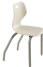
19" W19.75 D21.25 H34.5 Seat: W17.5 D17 H19