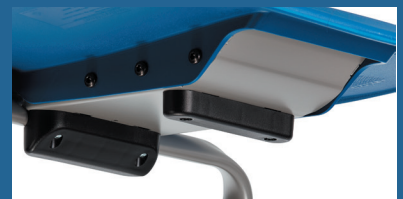
Stacking bumpers prevent damage to other chairs and worksurfaces.