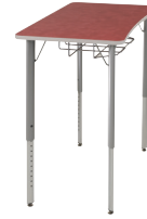
ADA W36 D20 H22-34