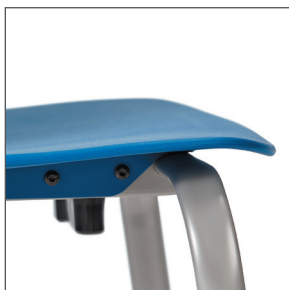
Waterfall seat front adds comfort and minimizes leg pressure