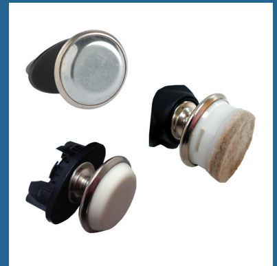
Steel, felt capped and nylon glides.