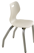
16.5" W16.75 D17.5 H29.25 Seat: W14.25 D14 H16.5