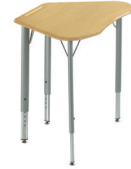
Adjustable W32 D20.5 H22-34