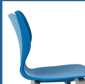
Passive flexing back offers ergonomic comfort