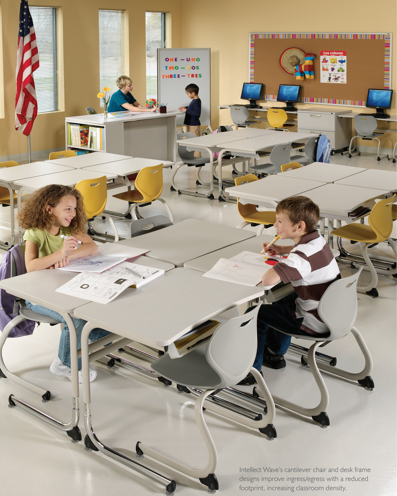
Intellect Wave's cantilever chair and desk frame designs improve ingress/egress with a reduced footprint, increasing classroom density.