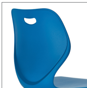
Smooth ribless back is easy to clean