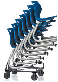
Stacked on dolly