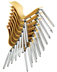
Stacked on floor