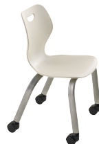
15" W16.75 D17 H26.5 Seat: W14.25 D14 H15