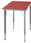
Adjustable W26 D19 H22-34