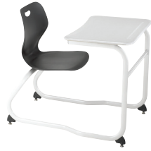
Large W26 D36.75 H32 Seat: W17.5 D17 H18 Belly Room: 16