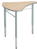
Contour W24.25 D37.25 H22-34