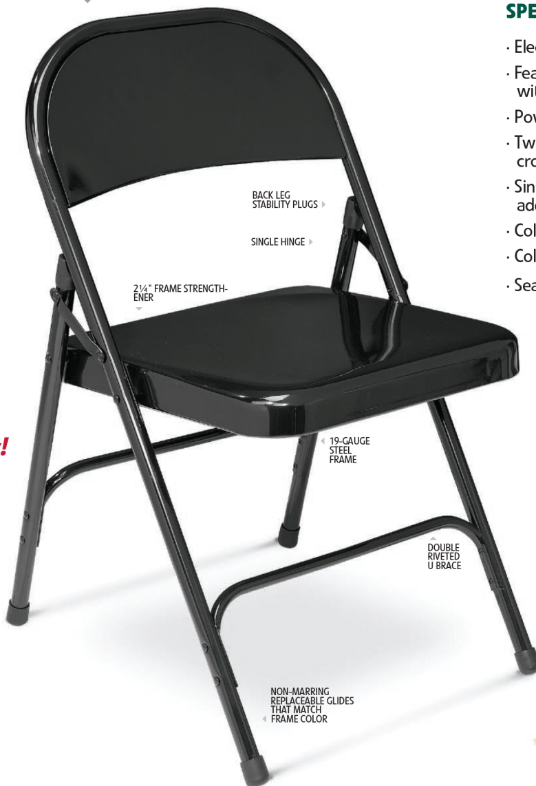
MODEL 510 SHOWN