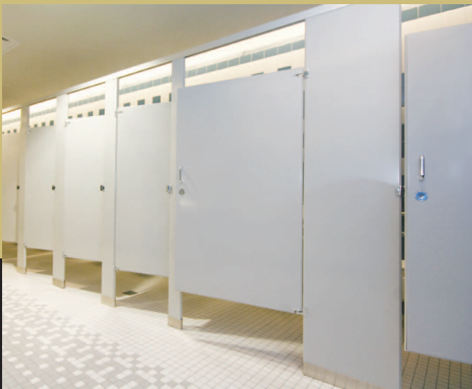
Standard partitions have open sightlines on sides and bottom.