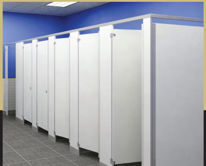
Ultimate Privacy eliminates sightlines into the compartment.