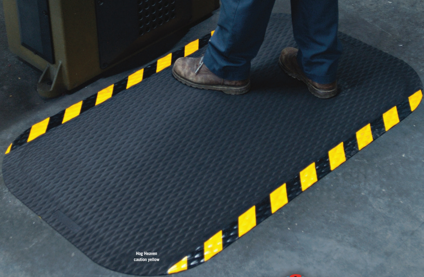
Hog Heaven caution yellow