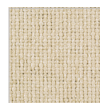
33 - Nutmeg