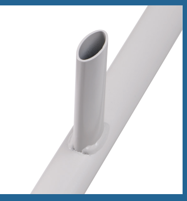
Elliptical tubing depth dimension is twice as thick as round tubing and more dent resistant. Exceeds ANSI/ BIFMA tests for back strength, back durability, seating drop, seating impact, leg strength and tablet arm load.