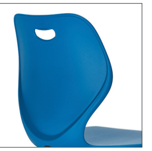
Smooth ribless back is easy to clean