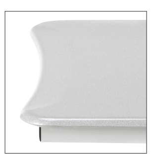
Curved desk edge provides increased belly room