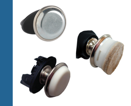
Steel, felt capped and nylon glides.