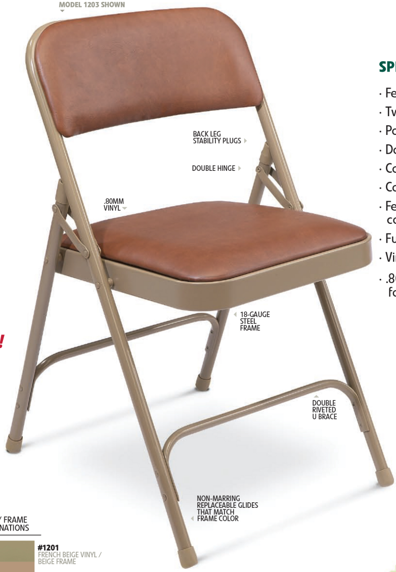
MODEL 1203 SHOWN