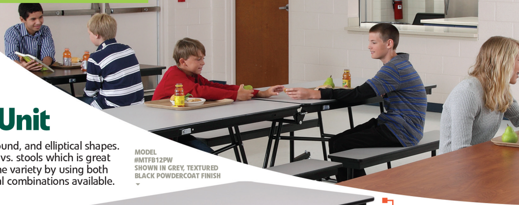
MODEL #MTFB12PW SHOWN IN GREY, TEXTURED BLACK POWDERCOAT FINISH