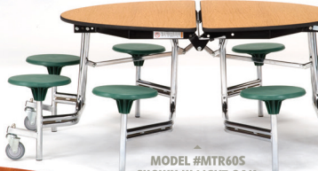
MODEL #MTR60S SHOWN IN LIGHT OAK, CHROME FINISH

MODEL #MTES-MDF-LE SHOWN IN WILD CHERRY, TEXTURED BLACK POWDERCOAT FINISH